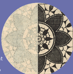
John Taylor, The Needles Excellency, London: Printed for James Boler, 1634, plate 21 (detail recto, detail verso).

Co-sponsors include USC's Department of Art History, the Department of French and Italian, the Visual Studies Research Institute, the California Rare Books School, and with the collaboration of the Istituto Italiano di Cultura Los Angeles.