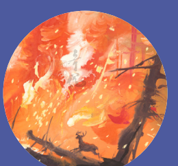
Bambi fire sketch