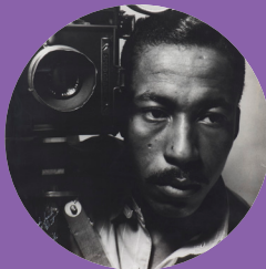
Photo: Gordon Parks, Self-Portrait, 1941, Private collection, courtesy of and copyright The Gordon Parks Foundation

PHILIP BROOKMAN (Consulting Curator, Department of Photographs, National Gallery of Art)