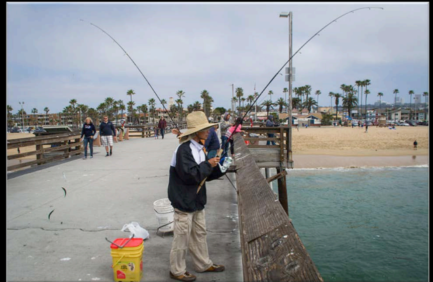
Balboa, CA