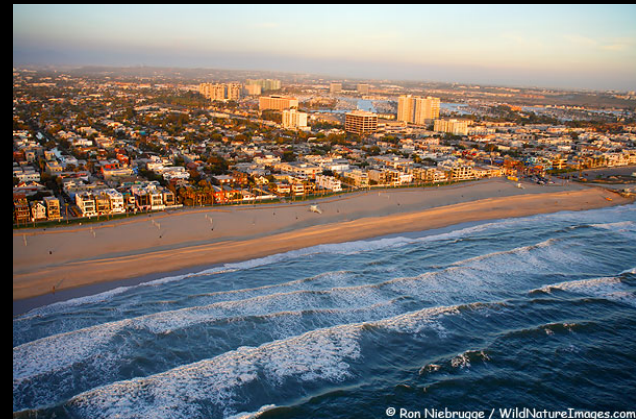
Venice Beach, CA