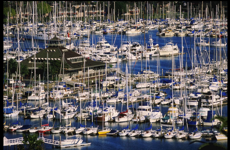
Mission Bay, CA