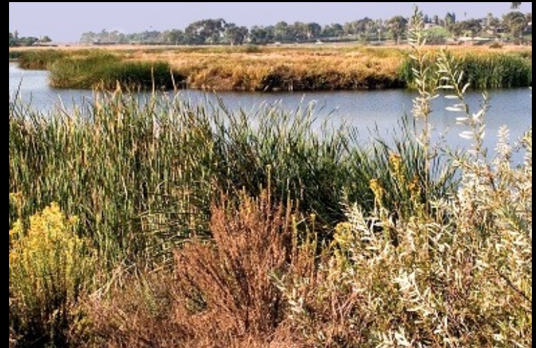
Buena Vista Lagoon, Carlsbad, CA