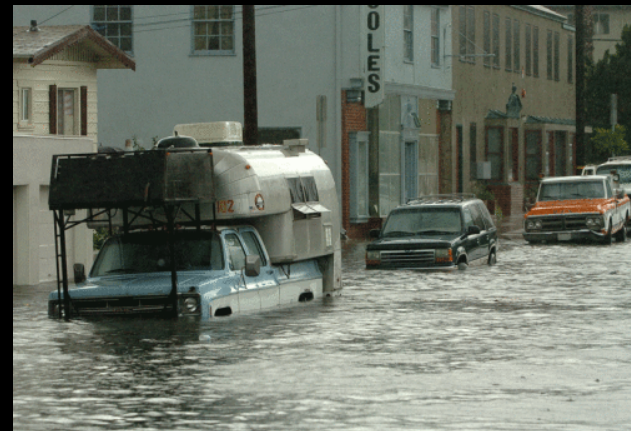
San Pedro, CA (2010)