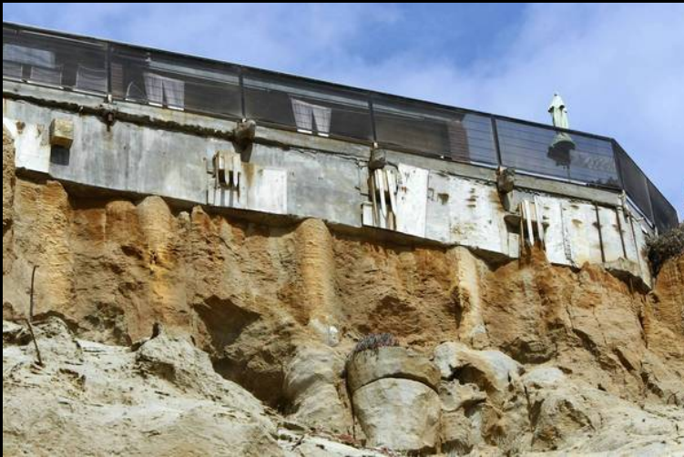
Solana Beach, CA (2013)