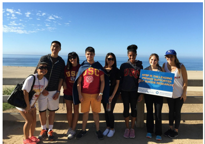
Psi Chi at the Suicide Prevention Walk