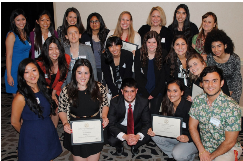
2015 Psychology Honors Program Cohort

The Undergraduate Symposium for Scholarly and Creative Work provides undergraduates with the unique opportunity to exhibit and share examples of their significant research and creativity. All undergraduates at USC are encouraged to participate. After all submissions are judged by a panel of distinguished faculty, an award ceremony recognizing the most outstanding works takes place at the end of the symposium. Psychology students compete in the largest category: Social Sciences.