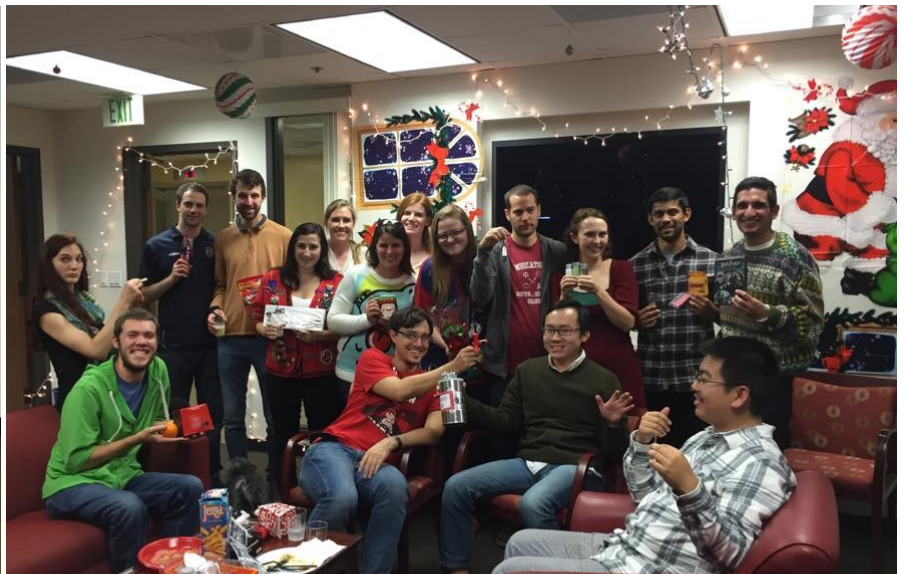
GASP Holidays Party