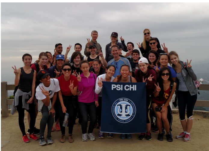
Psi Chi Atop the Mountain on their Hollywood Hike

The 2014-2015 academic year was very successful for USC Psi Chi. The student organization celebrated its 85th year on campus and had a record breaking number of new members for the second consecutive year. Psi Chi had almost two events per month this year, including topics that range from graduate school, research in psychology, and careers in psychology. Psi Chi also had a few social gatherings and charity events. In fact, USC Psi Chi raised about two thousand for cancer research, through "Relay for Life" and suicide prevention, through the "American Foundation for Suicide Prevention: Out of the Darkness Walk."