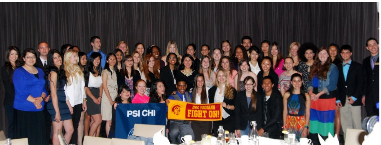
USC Psi Chi Chapter Annual Spring Banquet Party