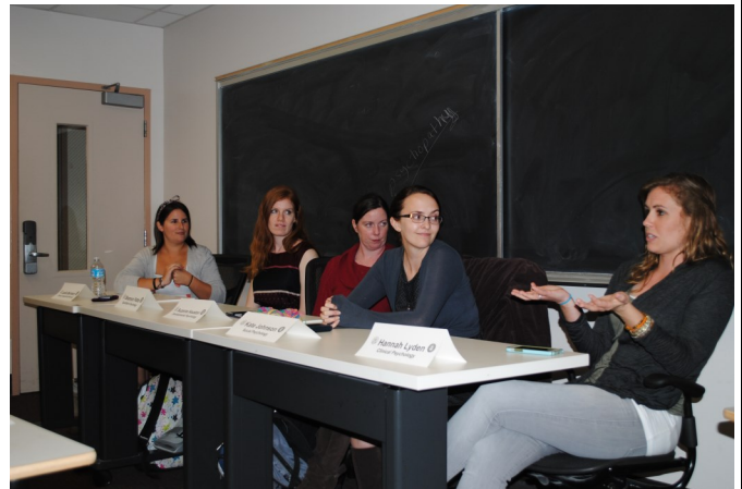
Doctoral students speaking to a classroom full of our undergraduates about life in a psychology graduate program.

The Graduate Association for Students in Psychology (GASP) had a very productive 2014-2015! GASP had several panel discussions to help students think about job opportunities in the future and hosted several events to have fun and foster communication between areas. We had faculty at various stages in their career come give a talk on getting an academic job and what it's like at each stage of the process in February 2015. The following month we had faculty from various departments and disciplines, including Neuropsychology, come give a talk regarding creating a work-life balance and how that differs between departments and areas. The last panel discussion scheduled for April 2015 will discuss how to apply the advanced research methodologies taught in grad school to non-academic placements. Besides hosting these career-advancing talks, GASP also hosted several fun events to allow students to relax, including a Casino Night, Halloween Costume Party, as well as a White Elephant Christmas Party. GASP met its goal of creating opportunities for students to learn more about academia but also to create a fun space for students to interact, network, and have fun. We look forward to what 2015-2016 school year will bring!