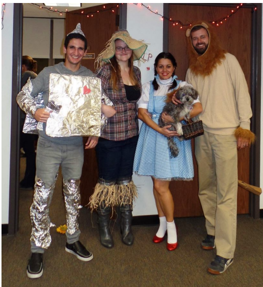
GASP Halloween Party