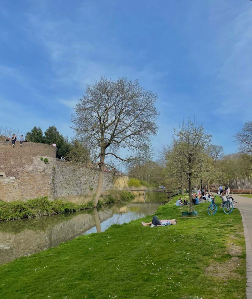
Maastricht, Netherlands