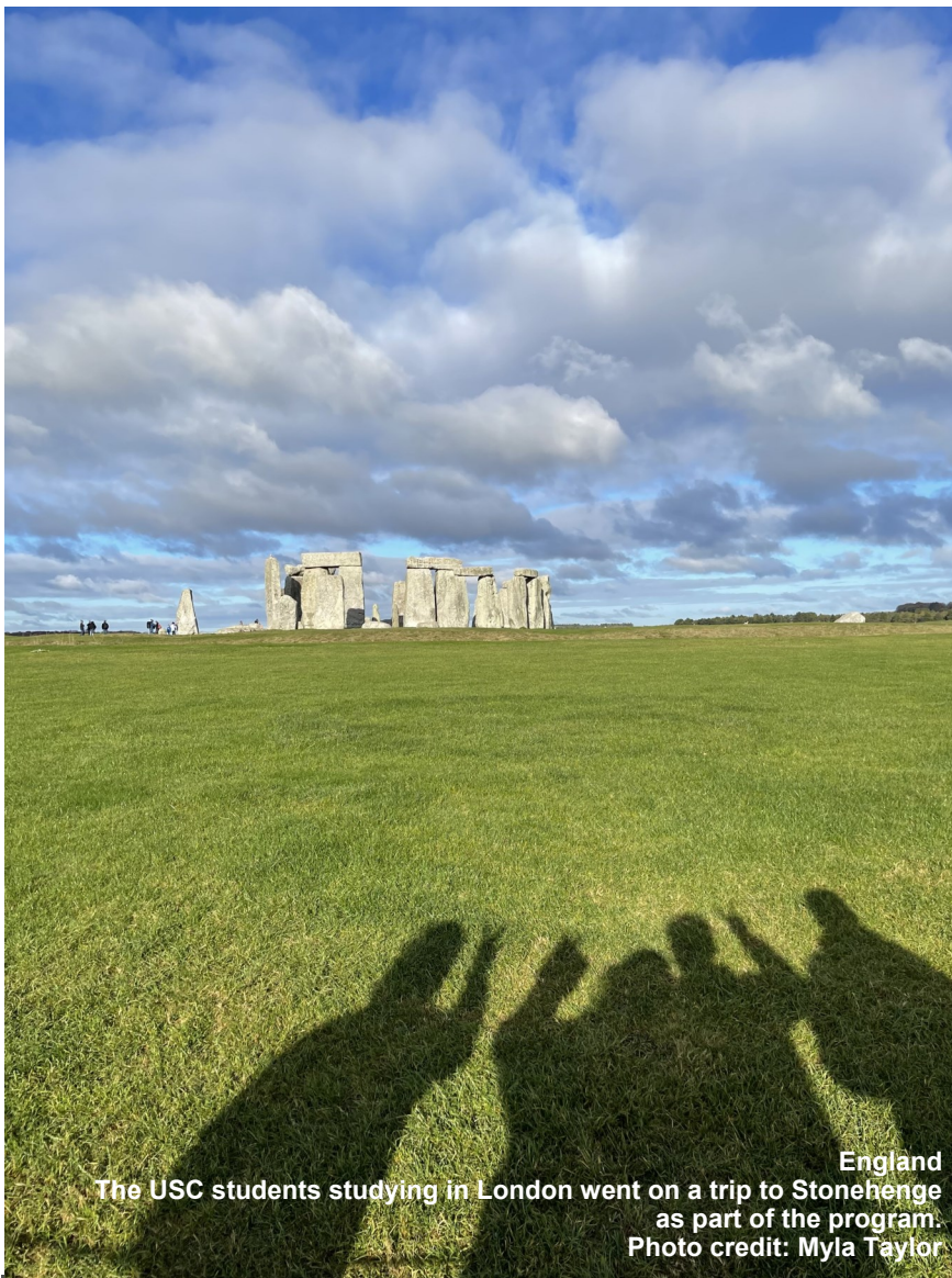
England The USC students studying in London went on a trip to Stonehenge as part of the program.

Office of Overseas Studies University of Southern California 3501 Trousdale Parkway, THH 341 Los Angeles, CA 90089-4354 Tel: 213.740.3636