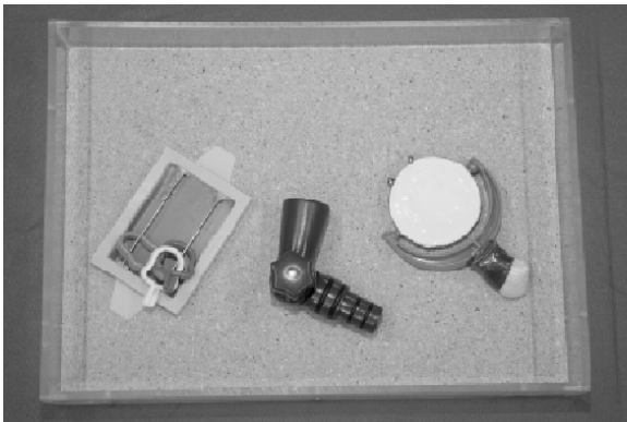
FIGURE 1 The three novel objects and the tray used in the study.

Each infant was randomly assigned to one of three experimental conditions, yielding 36 infants in each condition. Infants received only a single experimental