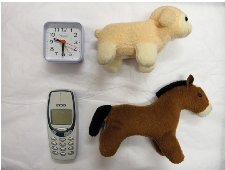
FIGURE 1 Sample of the stimuli used in the study. (Color figure available online.)

pairs, the order of objects within the pairs, and the objects' spatial location at test (target left or right) were also counterbalanced.