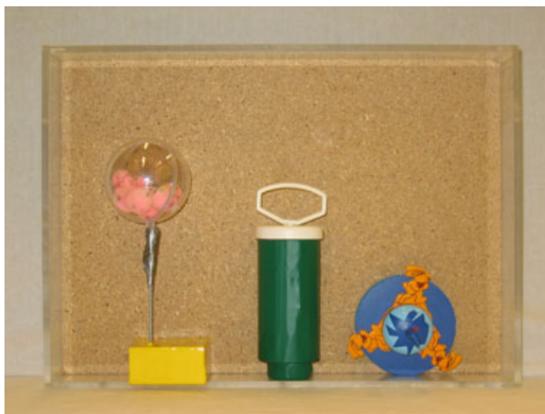
Figure 1 The three novel objects and the tray used in the study.

two conditions in which she remained co-present for the third object (Silent Presence and Communicative Presence Conditions, see below).