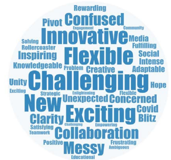
Figure 4. Three Words that Describe Your Experience with the 2020 Census collected from constituent interviews.

"The fast response of adapting the We Count LA campaign amidst the pandemic was impressive and it gave our organizations strength in the midst of very uncertain and precarious times. It gave us the tools to be able to continue to do the great work that we do and imagine the different ways in which we could continue to support our communities make them not be afraid and to fully understand the importance of being counted."