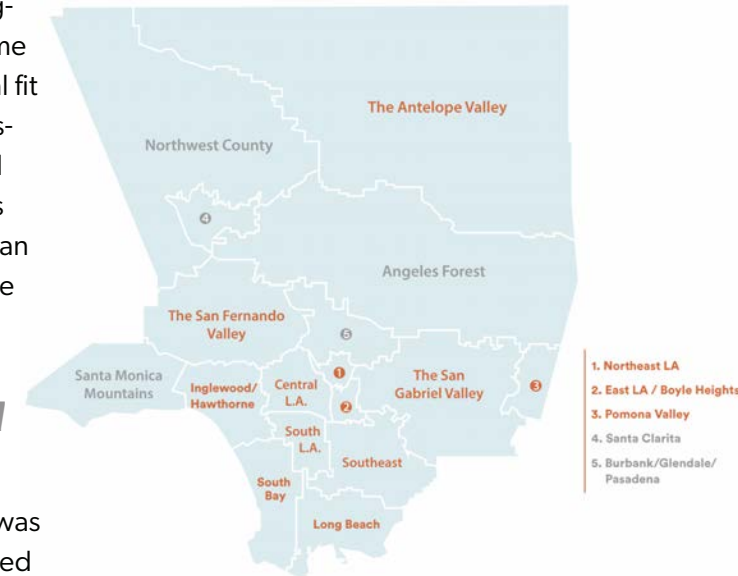
Figure 3. Regions within LA County that have high concentrations of HTC populations (in orange font)