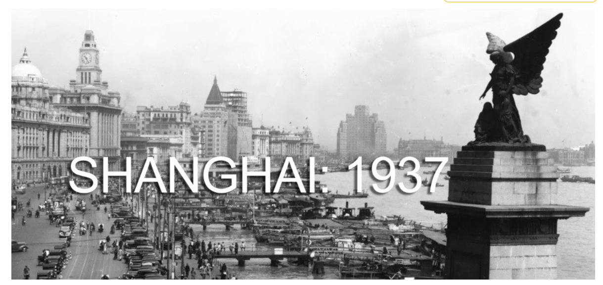
October 23, 2023