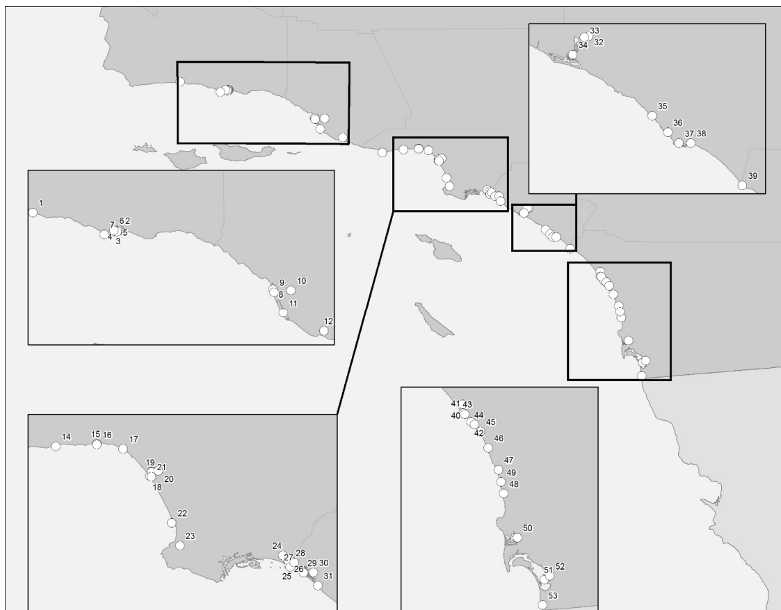
Figure 2. Map depicting fifty-three sampling locations along the Southern California Bight coastline. Santa Barbara and Ventura Counties (#1–12) 1 = Arroyo Hondo, 2 = Atascadero Creek, 3 = San Jose Creek, 4 = San Pedro Creek, 5 = Tecolotito Creek, 6 = Goleta Slough, 7 = Devereaux Slough, 8 = Ventura Harbor, 9 = Santa Clara River Estuary, 10 = Santa Clara River, 11 = Channel Islands Harbor, 12 = Calleguas Creek. Los Angeles County (#13–28), 13 = Zuma Lagoon, 14 = Malibu Lagoon, 15 = Topanga Creek, 16 = Topanga Lagoon, 17 = Rustic Creek, 18 = Ballona Lagoon, 19 = Marina Del Rey, 20 = Ballona Creek, 21 = Del Rey Lagoon, 22 = King Harbor, 23 = Malaga Creek, 24 = Colorado Lagoon, 25 = Alamitos Bay, 26 = Mother’s Beach, 27 = San Gabriel River, 28 = San Gabriel River upstream. Orange County (#29–39), 29 = Seal Beach, 30 = Huntington Harbour, 31 = Bolsa Chica Channel/Basin, 32 = San Diego Creek, 33 = Upper Newport, 34 = Back Bay, 35 = Aliso Creek, 36 = Salt Creek, 37 = Dana Point Harbor, 38 = San Juan Creek, 39 = San Mateo Creek. San Diego County (#40–53), 40 = Santa Margarita River, 41 = Oceanside Harbor, 42 = Loma Alta Creek, 43 = San Luis Rey River, 44 = Buena Vista Creek/Lagoon, 45 = Agua Hendionda, 46 = Batiquitos Lagoon, 47 = San Elijo Lagoon, 48 = Los Penasquitos, 49 = San Dieguito River, 50 = Mission Bay, 51 = San Diego Bay, 52 = Sweetwater River, 53 = Tijuana River/Estuary.

Cyanotoxin analysis was primarily conducted using ultra high performance liquid chromatography with HPLC-UV using an Agilent Infinity 1260. Separation was carried out with an Agilent Zorbax RRHD Eclipse Plus C18, 2.1 × 50 mm, 1.8 μm column (Agilent Technologies, Santa Clara, CA, USA). The method was adapted and modified from [57,73,74]. The mobile phase consisted of A: H 2 O, 0.01% TFA, B: MeCN, 0.01% TFA. The elution gradient began with 20% B from zero to 4 min, with a transition to 70% B by 4.2 min. This was followed by an increase to 95% B by 4.6 min and this was held until 5.4 min, with a subsequent decrease to 20% B by 6 min, and held for 1.5 min. The flow rate was 1 mL/min and the column was heated to 30 °C. Anatoxin-a and derivatives were considered ‘anatoxin positive’ due to lack of ion fragmentation patterns obtained from HPLC-UV