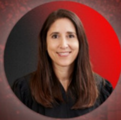
KEYNOTE SPEAKER CHIEF JUSTICE OF CALIFORNIA PATRICIA GUERRERO