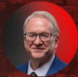
JOHN HOYT GOULD SCHOOL OF LAW DIRECTOR OF ADMISSIONS