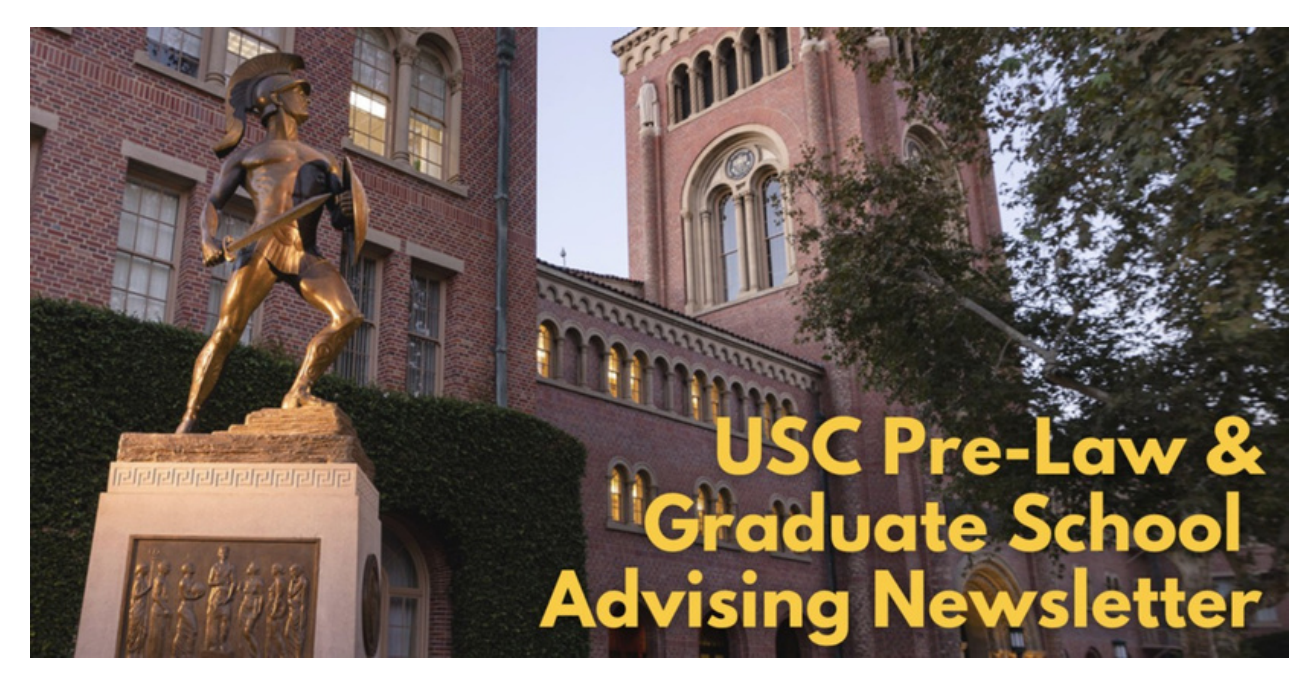
January 8, 2024

Good morning, Trojans! Happy first day of the Spring 2024 semester! We hope you had a rejuvenating winter break and a good holiday season. There are A LOT of great events and opportunities coming up so make sure to keep an eye out for our newsletters every Monday morning!