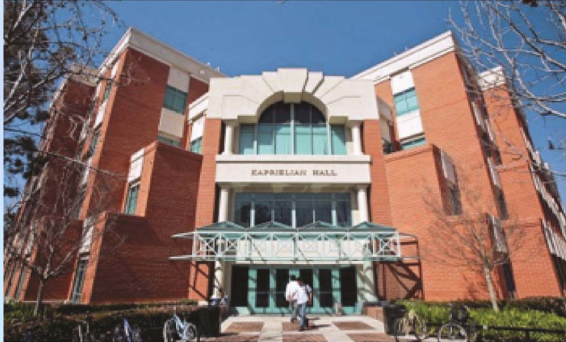
Kaprielian Hall home of the USC Math Department