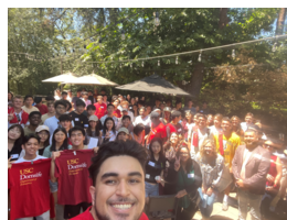
Economics Department new student welcome reception