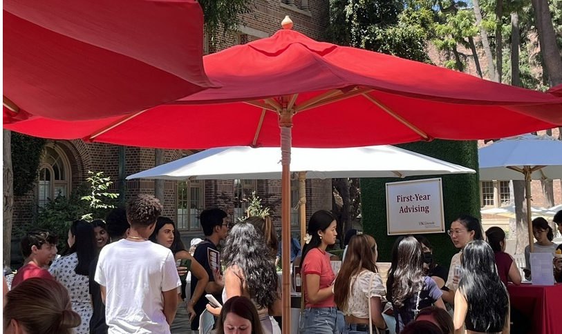
FYA booth at the Dornsife Welcome Experience: Student Reception