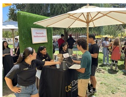
Dornsife Student Ambassadors at the Dornsife Welcome Experience: Student Reception

The First-Year Advising (FYA) team and all of Dornsife is excited to have a new freshman class join the Trojan family! Several activities helped get the school year started, and we were happy to see so many of you there!