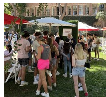
Dornsife Toolkit at the Dornsife Welcome Experience: Student Reception

Join us at our next event, the FYE KICKOFF SOCIAL , this Wednesday, August 30, 4:00-6:00 PM at Tommy's Place . Click the image below to RSVP . Hope you can make it!