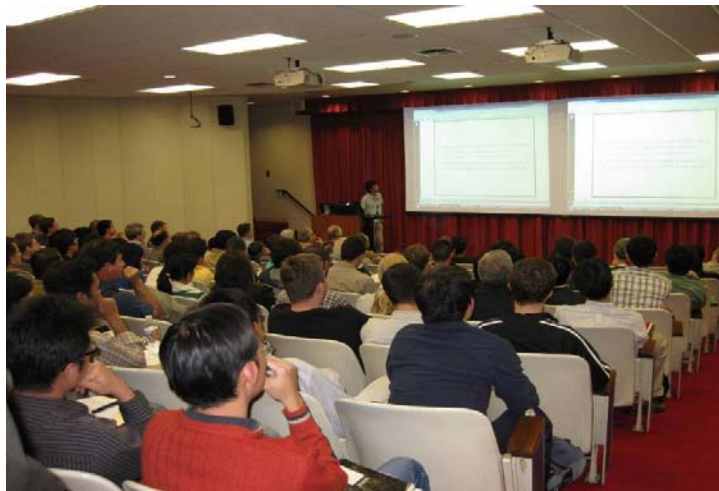
Terrence Tao's CAMS/Whiteman Lecture 2009

More photographs of the "new" Math Department in KAP can be found at http://owl.usc.edu/mathphotos . These include pictures of our attractive Common Room where paintings generously donated by the Busemann family have pride of place. Of course Alumni are most welcome to visit and will usually find "goodies" served at 3:00 p.m. on Mondays, Wednesdays and Fridays.