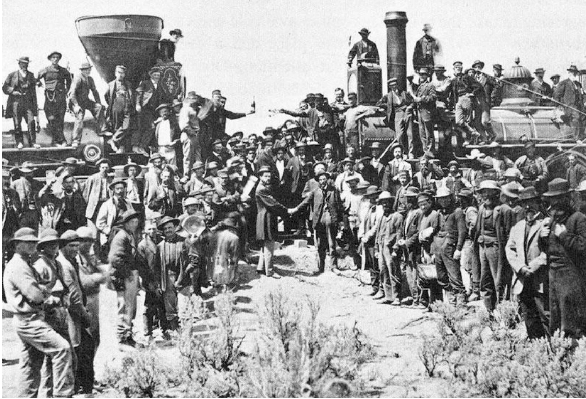
The ceremony for the driving of the golden spike at Promontory Summit, Utah on May 10, 1869 xvi

Can we read the first poem of César Vallejo's Trilce as if it were a spirit photograph, in a way that clears a space of haunting? John Harvey explains that the genre of spirit photography claimed to show those who were dead as though they were alive too .... [T]he "now dead" lived, not in cryogenic suspension, as a perpetual moment of life (frozen before death and captured on film), but with the inference that the photograph represented one instant in a continuity of life that extended eternally beyond the bounds of the exposure. (156)